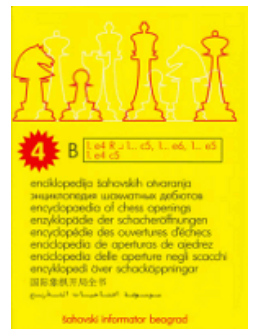
ECO B by Chess Informant