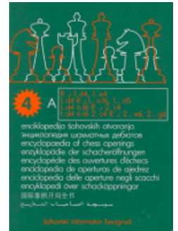
ECO A by Chess Informant

Purchases from our shop help keep ChessCafe.com freely accessible: