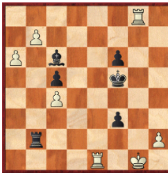
[FEN "6R1/1P6/P1b2p2/2p2k2/2P5p2/1r5P/4R1K1 w - - 0 1"]